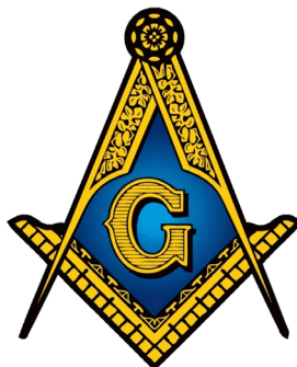
David Elliott Lodge # 364 Chartered June 09, 1873