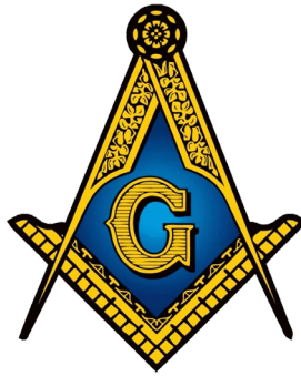
David Elliott Lodge # 364 Chartered June 09, 1873